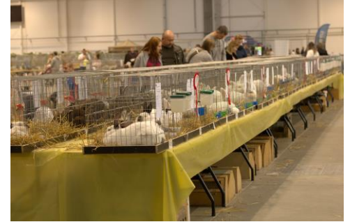
Solar 760L