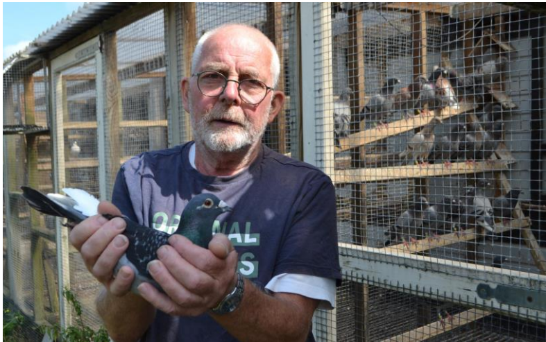
Balkster Courant, 2023