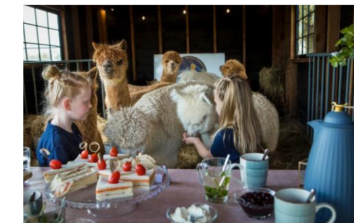
Beleef het lage Noorden