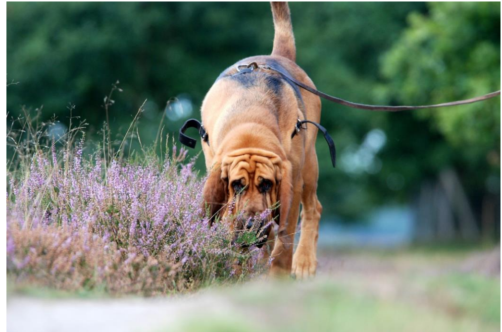
Raad van Beheer