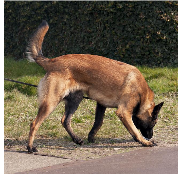
Speurhonden Instructie School