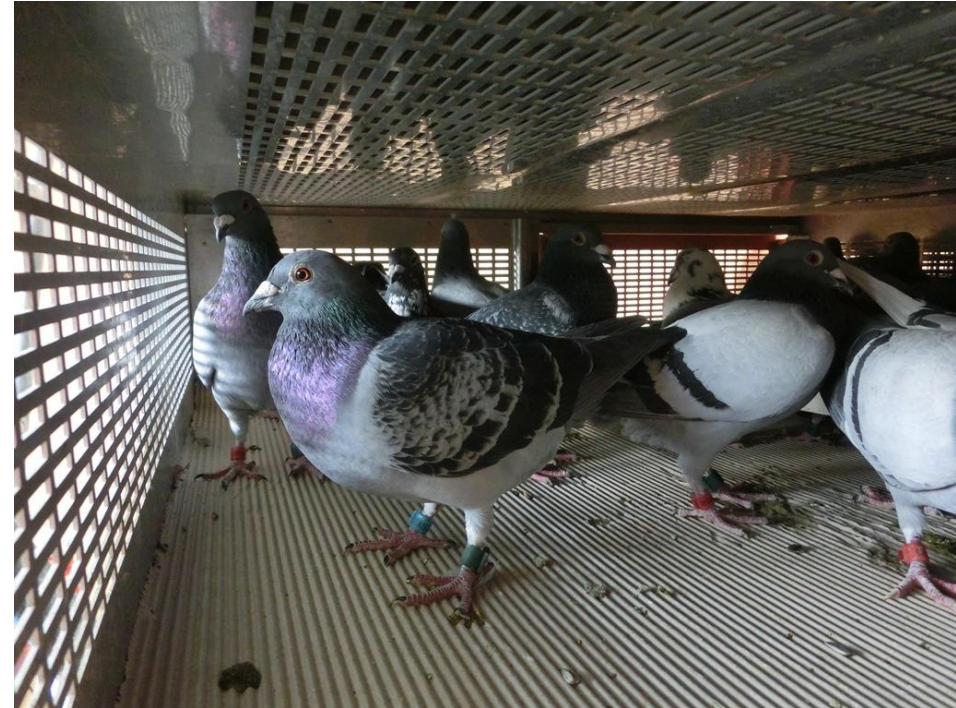
Wetenschappelijk Onderzoek Welzijn Duiven